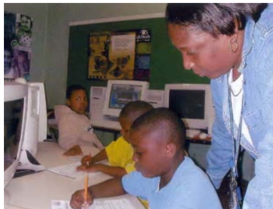
The Boys and Girls Clubs' famous "Power-Hour" Homework Program

After school, children need a safe place to play and one-on-one help with homework and strengthening academic skills. Sad but true, these are not always available at home. Some parents are undereducated; most have to work during after-school hours; and frankly, some do not place a high value on their child's educational growth. Two Boys & Girls Clubs work hard to deliver quality services through satellite sites beyond the home Club. Beaufort's Club serves Ridgeland, Walterboro, Estill, Sheldon, and Yemassee. Charleston's works out of four public schools and Clubs in Charleston and Mt. Pleasant. www.bcclubta.org