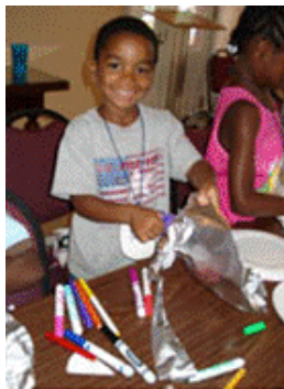
Guild's Summer Art is #1